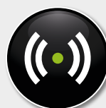
Safe WiFi connection